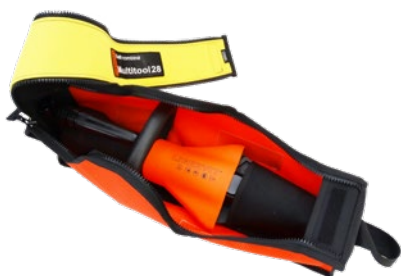
delivered with Multitool28's transport bag, ref. ST/M28