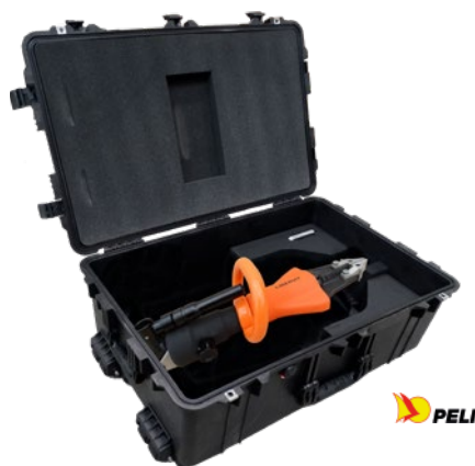
on option, PELICASE® transport case, ref. VDT/M28